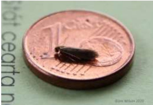
Micro moth species