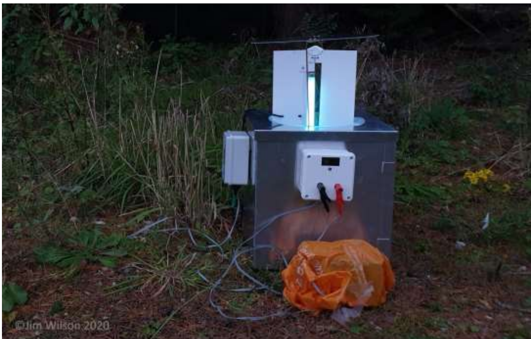
6w Actinic Heath Trap.

To do this we had to trap them and for this you have to have a license from the National Parks and Wildlife Service. One of the best methods to catch them is to use a bright light. Most of you will have seen a moth flying around a light. Studies have shown that the light from an actinic bulb is very good for attracting them. Some of you might be familiar with the bluish light that you might see in a butcher shop, which is an actinic bulb. Unlike that used there our traps do not kill the moths and all are released unharmed after identification. For our survey we mainly used a trap with a 6w actinic bulb, called a Heath Trap, which is a small trap but catches enough moths to keep you busy for an hour or two just after dawn. We occasional used both a 6 watt and a 12 watt trap. The traps were placed in a variety of habitats at HIW because many moths lay their eggs on particular plants on which their caterpillars will feed, found in particular habitats. Using bigger traps with brighter lights increases the possibility of finding more species.