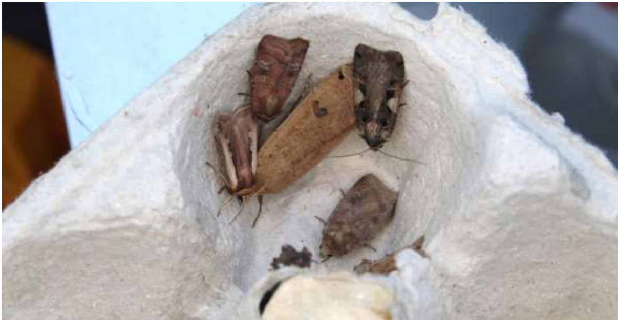
A nice variety of moths in the trap (18 th August 2020)

For our first year we did very well with 675 moths of 120 different species identified. We are sure that we will add many more to the list in the coming years.